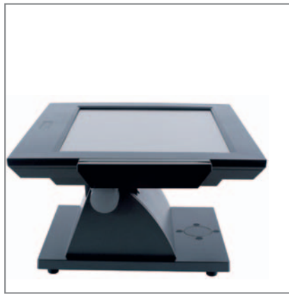
PANEL 0 - 70° tilt angle