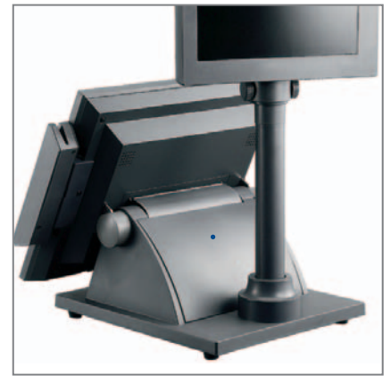
CUSTOMER DISPLAY POLE TYPE VFD 2 X 20 or Graphic LCD (optional)